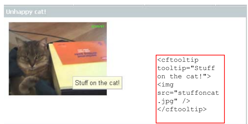
Figure 8. Using the CFTOOLTIP tag

Every now and then you may want to put a little bit of explanatory text in your web application to help guide users (see Figure 8). You could go find a JavaScript library to do this on your own, or you could use the very simple CFTOOLTIP tag. Just specify the text you want to show in the tooltip and wrap the content you want the tooltip to apply to with the CFTOOLTIP tag.