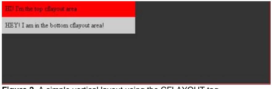
Figure 2. A simple vertical layout using the CFLAYOUT tag

Figure 2 shows a simple vertical layout.